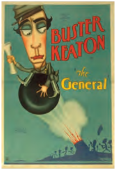
September 5 The General