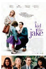
October 13 A Kid Like Jake*