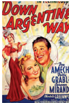
October 17 Down Argentine Way