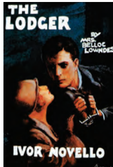
September 12 The Lodger