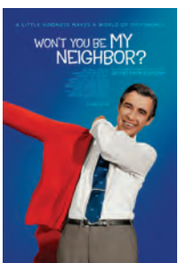
September 8 Won't You Be My Neighbor?

Films screened Saturdays, 2:00pm & 7:00pm.