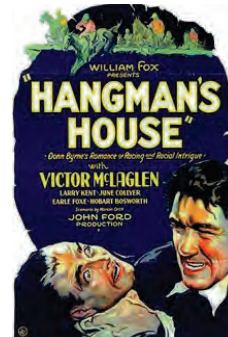
September 26 Hangman's House