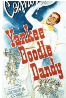
October 10 Yankee Doodle Dandy