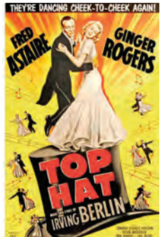
October 3 Top Hat