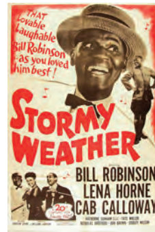
October 24 Stormy Weather