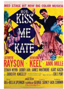
October 31 Kiss Me Kate